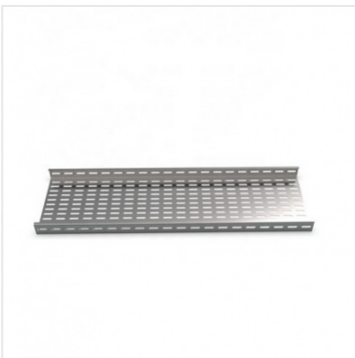
HXW Cable Tray Professional cable tray manufacturer